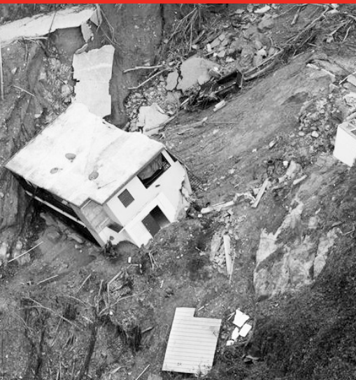
One of thousands of destroyed homes in Puerto Rico.